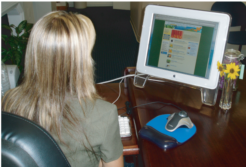
District customers can take an online gardening course by visiting bewaterwise.com .

Get a custom watering schedule that is tailored to your landscape and our Laguna Beach climate at bewaterwise.com .